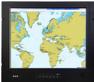
DISPLAY UNIT 19 inch