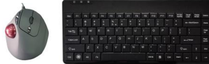
TRACKBALL & KEYBOARD