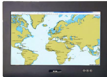
DISPLAY UNIT 24 inch

NES-3000 ECDIS is designed for international-voyage vessels to display vessel information received from onboard sensors such as GPS, Gyro, Log, radar and AIS together with geographical information retrieved from Electronic Charts. NES-3000 is a core navigation tool that meets the marine standards ECDIS (Electronic Chart Display Information System) and RCDS (Raster Chart Display System). NES-3000 is designed to run under Microsoft Windows Operating Systems.